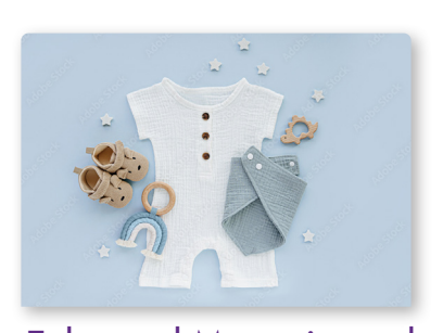
Enhanced Maternity and Paternity leave

Quantum operates an annual bonus scheme. Bonus payments are made subject to Quantum's overall financial performance and recognises the work, effort and commitment over and above the level normally expected as part of the individual's role.